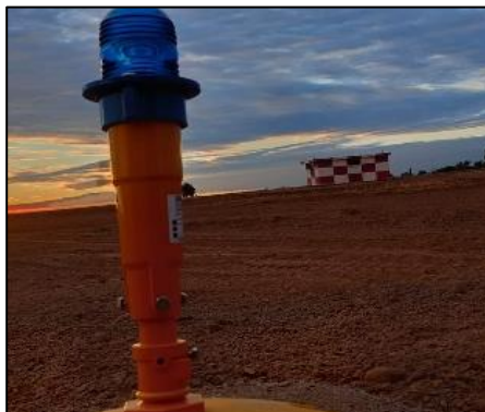
Taxiway light installed