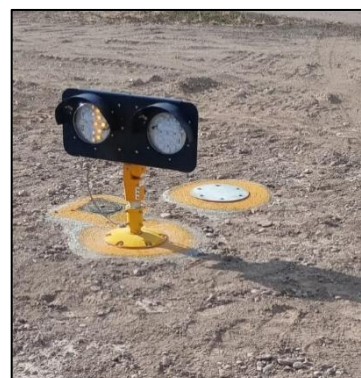
Runway guard light installed