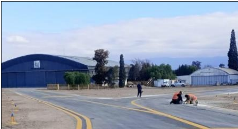
Taxiway lights installation