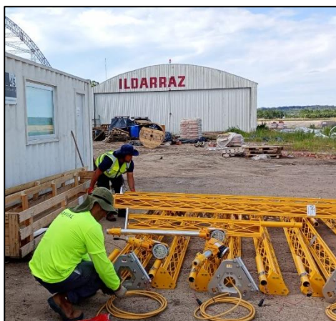
Preparation of masts for ALS lights