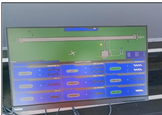
Control system installation