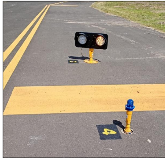
Taxiway and runway guard Lights